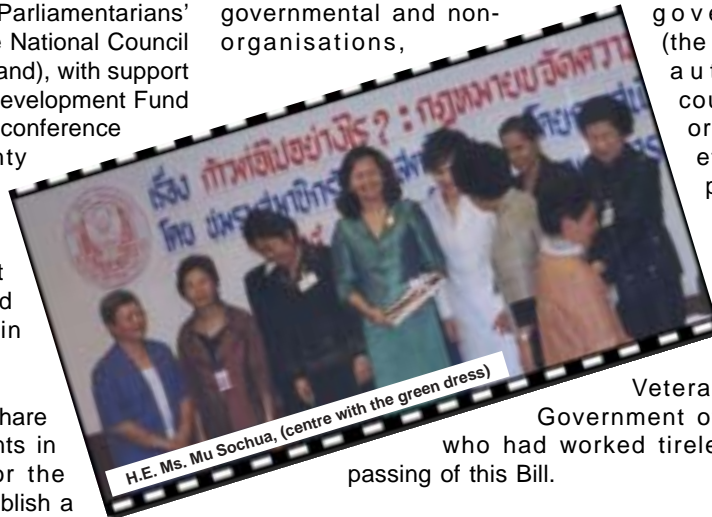
H.E. Ms. Mu Sochua, (centre with the green dress)

Session two was devoted to Cambodia's experiences with the passing of the Domestic Violence Bill, which aims to prevent domestic violence and assist victims by enforcing protection orders with the help of governmental and non-organisations,