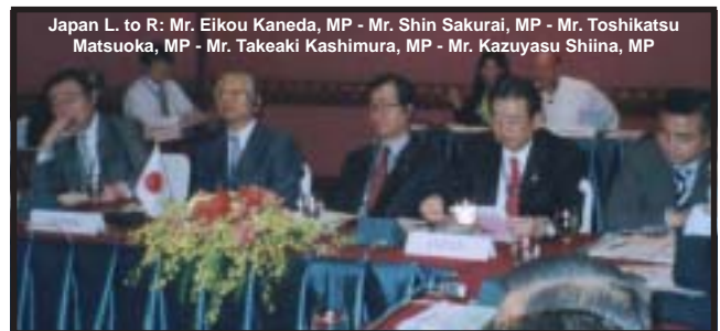
Japan L. to R: Mr. Eikou Kaneda, MP - Mr. Shin Sakurai, MP - Mr. Toshikatsu Matsuoka, MP - Mr. Takeaki Kashimura, MP - Mr. Kazuyasu Shiina, MP