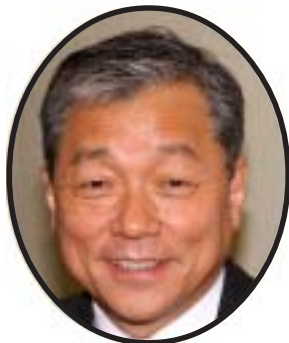
Mr. Jong-Wook Lee, elected to head the WHO

Geneva – A tuberculosis expert from South Korea was elected on Tuesday, January the 28 th , to head the World Health Organisation, (WHO).