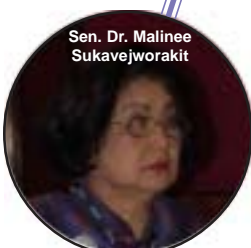
Sen. Dr. Malinee Sukavejworakit

B angkok, Thailand – AFPPD organised its first standing committee meeting on food security, water and globalisation on the 7 th and 8 th of February to discuss the increasingly important issue of food security in Asia and the role AFPPD could play in this area as well as what kind of programmes it could conduct. The two-day meeting was attended by thirty-five participants. This included twenty-four parliamentarians from Bangladesh, Fiji, India, Indonesia, Japan, Malaysia, the Philippines, Thailand, and Vietnam, resource persons from UNESCAP, FAO, Angiang University Vietnam, the Wira Institute in Malaysia, and AFPPD staff.