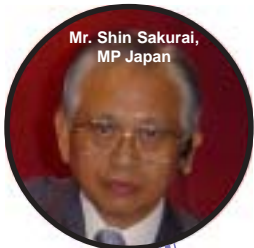
Mr. Shin Sakurai, MP Japan