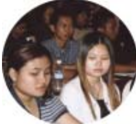
Students attending the forum