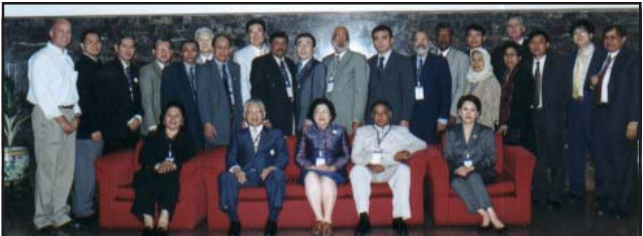
Participants at the the Food Security Meeting

AFPPD Standing Committee on Food Security Discusses Globalisation