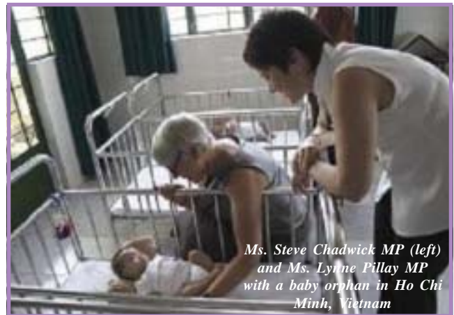
Ms. Steve Chadwick MP (left) and Ms. Lynne Pillay MP with a baby orphan in Ho Chi Minh, Vietnam

The trip was also an opportunity for parliamentarians to build an understanding of how the pandemic might develop in the Pacific. With latest figures placing the number of people in the Pacific living with HIV/AIDS at 10,000 (likely to be 10 times higher due to under-reporting) the stage is set for an expanding and widespread HIV pandemic in the region. However, because current prevalence levels remain low, there now exists a unique opportunity to curb the spread of the virus before it is too late. The visit showed the effectiveness of early intervention, and the very limited window of opportunity. It also demonstrated ways in which Asia, Pacific and New Zealand MPs can work together on the issue of HIV/AIDS.