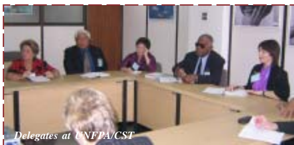
Delegates at UNFPA/CST

22 nd April – The day began with a visit to UNFPA/CST