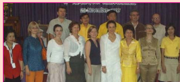
European Parliamentarians group during Bangkok study visit

Seven European parliamentarians from donor countries participated in a second field visit to Viet Nam which included an introduction to Viet Nam's youth-friendly health services, set up over the past three years with support from the European Union (EU) and the United Nations