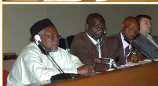
Parliamentarians during the thematic group discussion

"Ensure that national legislation takes into account the aspirations of young people and their sexual and reproductive health and rights, recognizing that they have a crucial role to play in decision-making and development processes."