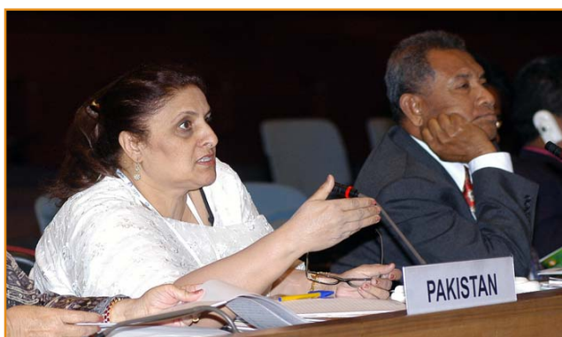
Parliamentarian from Pakistan entering into discussion during the Regional group session, and parliamentarian from Palau