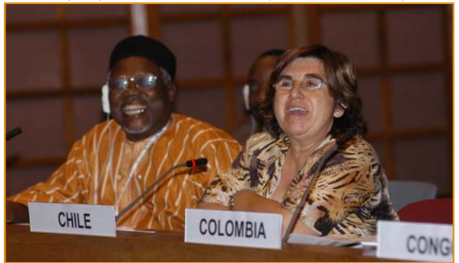
Parliamentarians from Chad and Chile