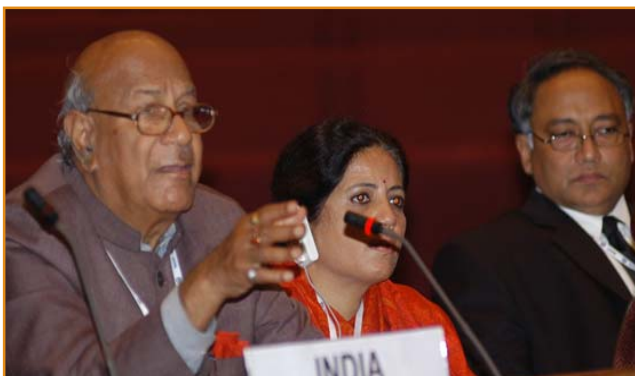
Parliamentarians from India during the Regional group discussion