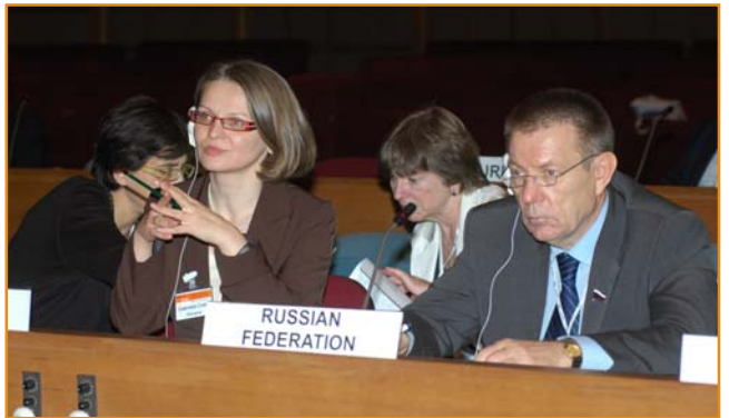
Parliamentarians from Russian Federation during Drafting Session