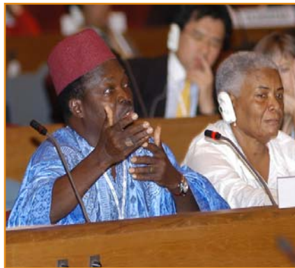
Hon. Leon Bio Bigou, MP from Benin and Parliamentarians from Bhutan discussing issues with the panel of Ministers.

Hon. Nassour Guelengdouksia Ouaidou began by giving a thorough analysis of the situation in Africa, and stating up front, that Africa is far behind in reaching the goals set out by Cairo and those of the MDGs. He highlighted poverty, which affects 44% to 46% of the population, and the lack of education efforts towards the disparities between girls and boys, between countries and between geographical areas in each country. Africa is not only impacted by high rates of maternal and infantile morbidity and mortality, the prevalence of HIV/AIDS and related deaths, which is much higher when compared to other continents, but also other issues including access to drinking water, natural disasters, conflicts and wars in Africa and the low performance of economic and social policies. His speech also involved the unfavourable governance, political and legal environment, that made meeting the MDGs a difficult task.