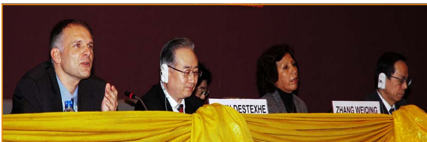
Session moderator Mr. Alain Destexhe addressing the meeting, with Chinese Minister Mr. Zhang Weiqing, National Population and Family Planning Commission; Bolivian Minister of Governance Ms. Alicia Mu oz Al and the Chair of the Session Mr. Fukuda, MP, Japan on the panel.

The session on Special Guest Statements was moderated by Mr. Alain Destexhe, Senator (Belgium) and President of PGA. Acting in the role of Chair, Mr. Fukuda introduced the speakers and facilitated the exchange of views from the floor. Presenting in the session were Mr. Zhang Weiqing, Minister, National Population and Family Planning Commission, China; Ms. Alicia Mu oz Al, Minister of Governance, Bolivia and Mr. Nassour Guelengdouksia Ouaidou, President of the National Assembly, Chad.