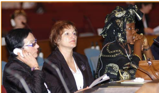
Parliamentarians from Lithuania and Liberia