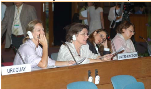
Parliamentarians from the United Kingdom and Turkey during Drafting Session