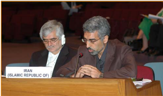
Parliamentarians from Iran