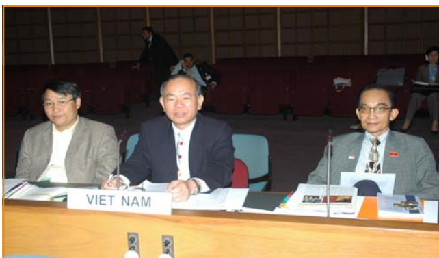
Parliamentarians from Viet Nam