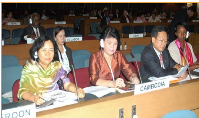
Parliamentarians from Cambodia and Burundi