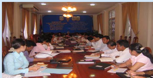
Participants at the training course

Cambodian Association of Parliamentarians on Population and Development (CAPPD) conducted training courses on gender analysis in October. In cooperation with Ministry of Women Affairs and with the support of the UNFPA office in Cambodia, CAPPD organized the Gender Analysis Training Course with Chief and Vice-Chief of the National Assembly Secretariat on Gender Analysis and Advocacy, from October 26 to 28, 2005. It will also conduct a similar training course on gender mainstreaming and advocacy with Assistant to the Experts Commission of the National Assembly in late November.