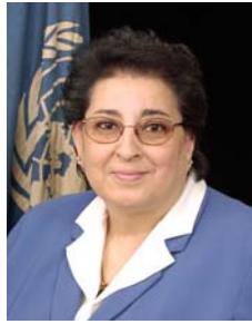
Dr. Thoraya Obaid

Report would be a reality check for such endeavor. The Report features an array of indicators that demonstrated the status of the efforts to achieve the MDGs in each country.