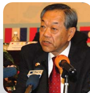
Ambassador Yasuyoshi Ichihashi

the conference will play a significant role in effective allocation of necessary resources, improvement in financial planning and management, transition from reliance on internal and external donor assistance to self-sufficiency within national budgets and promotion of the cooperation among the countries. He added that this conference will contribute to ensuring financial sustainability for increase in women's participation in political and social lives, addressing the health issues faced not only in Asia Pacific region also in the whole world, and promoting the cooperation among parliaments of the countries in the region. (The full text of the President's speech is annexed to this report).