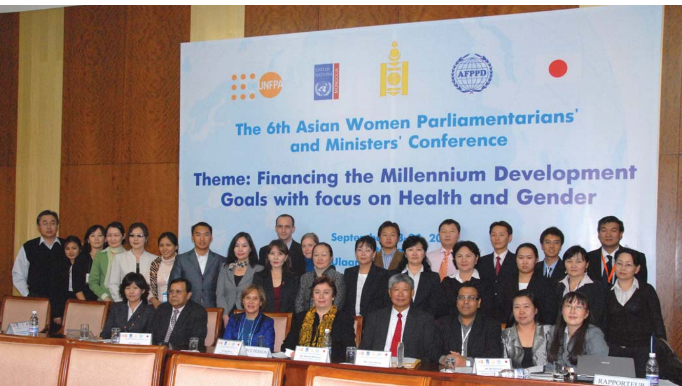
Staff members of AFPPD, UNFPA and the Mongolian parliament