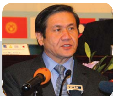
President Nambaryn Enkhbayar