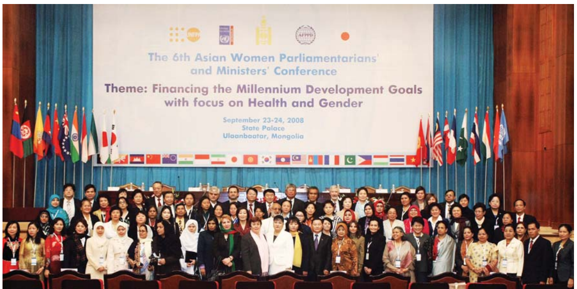
Group photo at the opening ceremony of the 6th Asian Women Parliamentarians' and Ministers' Conference held at the State Great Khural (Parliament) of Mongolia.

Adopted by the Conference delegates on this 24th day of September, 2008, in Ulaanbataar, Mongolia.