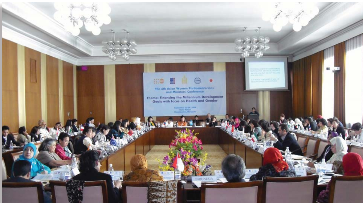
Conference hall at the State Great Khural of Mongolia