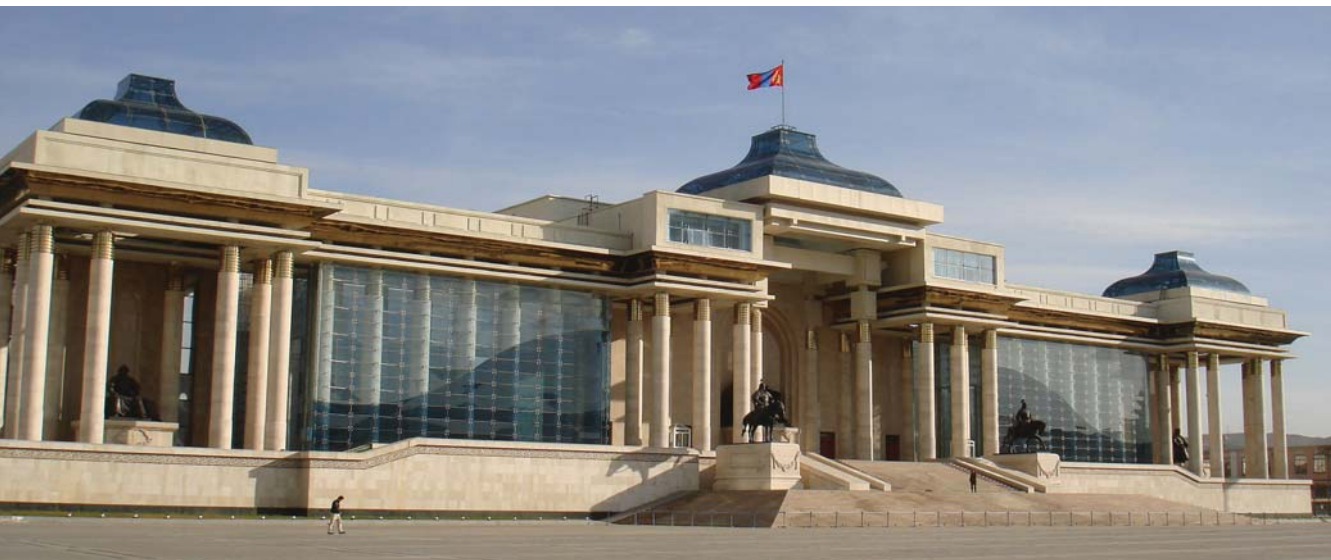
The State Great Khural (Parliament) of Mongolia in Ulaanbaatar