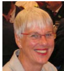
Ms. Steve Chadwick, MP