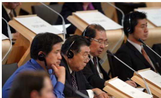
Japanese parliamentarians at the G8 Conference