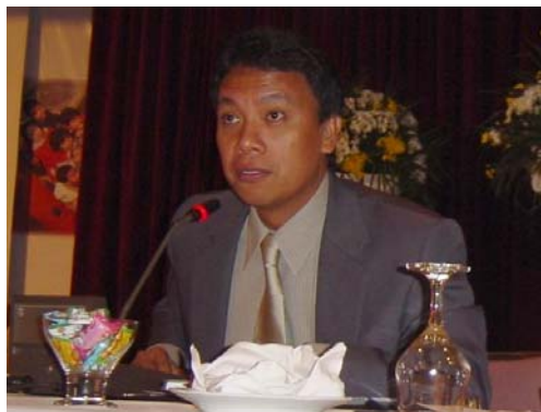
Rep. Nereus Acosta of the Philippines is a leading advocate of Reproductive health issues in the Philippines.