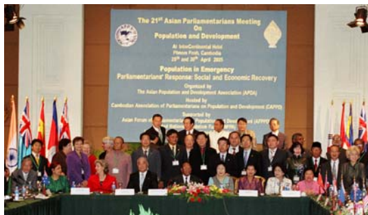
Group photo of the 21st Asian Parliamentarians Meeting organized by APDA and CAPPD with cooperation from AFPPD

On 29th and 30th April more than 40 Member of Parliament and Asia Pacific and Central Asia assembled in Phnom Penh, Cambodia for the