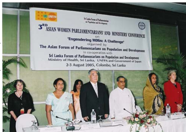
Opening Ceremony at Women's Conference

The Conference brought together male and female parliamentarians and women Ministers to review the current situation of women in the region and examined the role played by both male and female parliamentarians in improving the status of women, and how to implement legislation to empower women. Also discussed was the impact of MDGs in promoting gender equality and the empowerment of women. Deputy Executive Director of UNFPA Ms. Imelda Henkin spoke on “MDGs: What Do They Mean For Women?” and was quite clear that all parliamentarians can and must be a powerful force for change. Other topics, which were presented and actively discussed among the participants, were “Women and Poverty: Do MDGs Matter?”; “The Silent Tsunami: Sexual and Gender Based Violence – A Violation of Women's and Girls Right to Health”; “HIV/AIDS – Women are Especially Vulnerable”; Education and Employment: Discrimination Continues”; “Criticality of