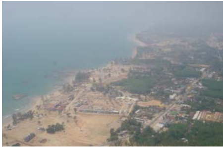
Kao Lak, Phanga Nga Province which was the greatest hit by the tsunami in Thailand

On the basis of periodical internal evaluation, several new initiatives were taken to enlarge our reach to parliamentarians. One of those initiatives is the Person-to-person advocacy (PPAP) to meet and discuss ICPD issues with most of the parliamentarians and state and locally elected representatives. PPAP is conducted in four countries with support from the Hewlett Foundation. The effectiveness of this approach has been acknowledged and other countries are now implementing this project. Second is the sector-wide approach, where special programmes are made directly towards parliamentarians with specific backgrounds like medical doctors, parliamentarians with academic backgrounds, like teachers and professors, and the next group would be parliamentarians with legal background. Work with women parliamentarians still remains our priority. Another area that AFPPD would like to reach in 2006 and 2007 is targeting young parliamentarians below 35 years of age.