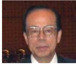
Mr. Yasuo Fukuda, MP