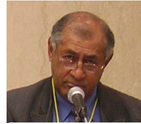
Hon. Ratu Epeli Nailatikau Speaker of Fiji