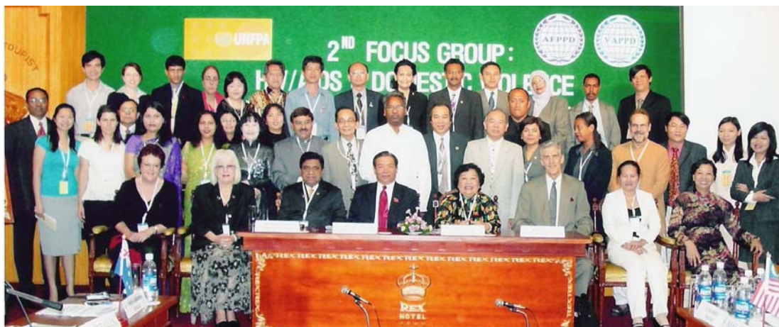
Vietnam Focus Group